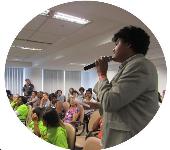
Someone speaking at a public hearing (RioOnWatch, 2018)