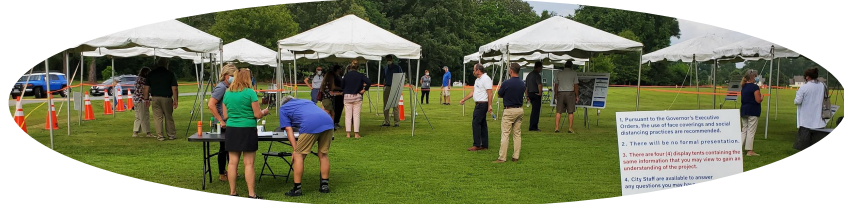
Suffolk city, Virginia, outdoor public hearing, June 25, 2020 (Halacy, 2020)

In some jurisdictions, VDOT can hold virtual meetings for transportation projects! Yet this still risks excluding a demographic that does not have stable access to broadband and Internet services.