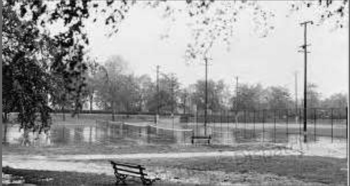
Byrd Park 1952