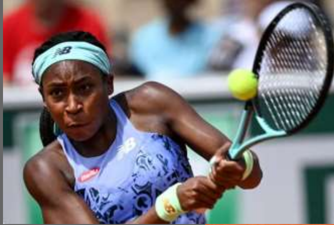
Coco Gauff Advances to 2022 French Open Finals